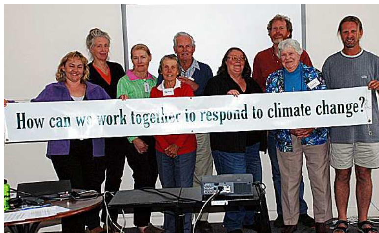
Guyra Local Forum Participants

Through a structured deliberative democracy process, the panel of residents developed a series of recommendations for local, state and federal government in response to the question “How can we work together to respond to climate change?”